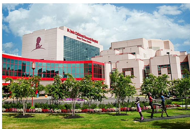
St Jude Children's Research Hospital (Memphis, TN)

The study did not yet demonstrate a survival benefit, although there was a potential signal in PFS. The investigators reiterated their belief that combination therapy was likely to be required for a significant treatment advantage in this disease.